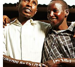
Love is a weapon to destroy evil