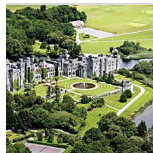
Amazing castle hotels